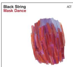
Album <Mask Dance> ACT - 2016. 10. 14.