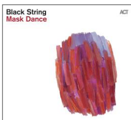
Album <Mask Dance> ACT - 2016. 10. 14.